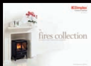
Electric fires brochure

Dimplex offers the widest range of electric space, water heating and renewable solutions in the UK. In addition to this publication, we have a number of more focused brochures as shown below. These can be ordered via our website: www.dimplex.co.uk/support