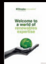
Renewables capabilities brochure