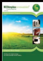
Heat pump brochure