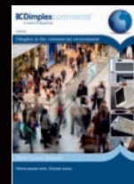
Commercial heating brochure