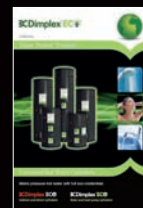
EC-Eau Cylinder brochure