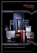
Domestic heating brochure