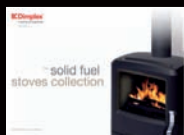
Solid fuel stoves brochure