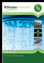
Solar Thermal brochure